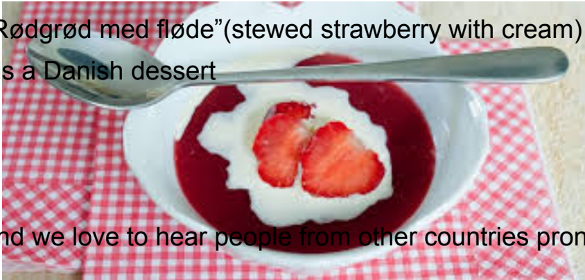
and we love to hear people from other countries pronounce it.