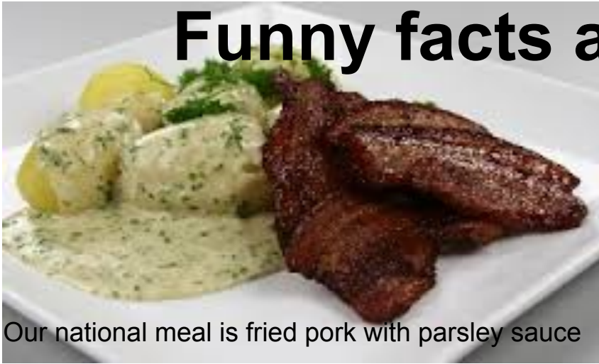
Our national meal is fried pork with parsley sauce