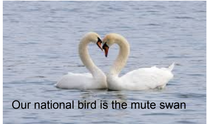
Our national bird is the mute swan