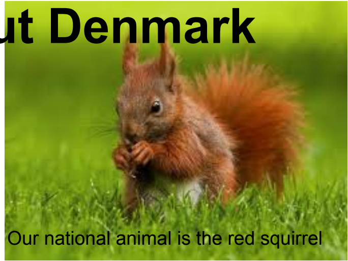
Our national animal is the red squirrel