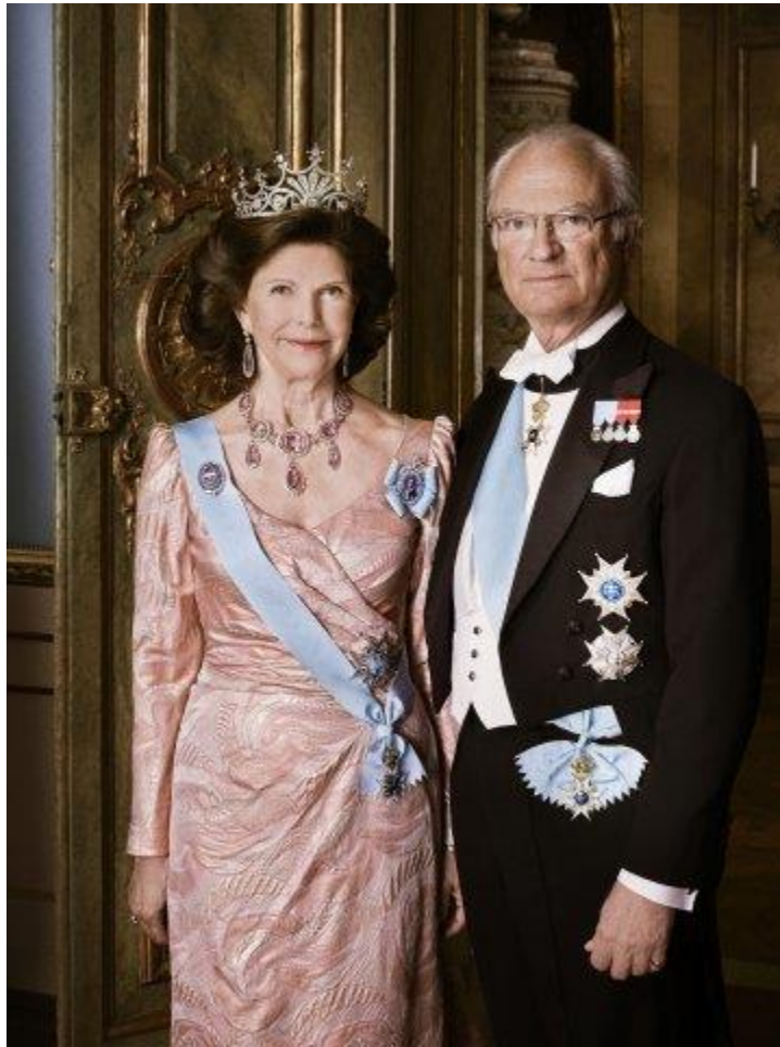
H.M. King Carl XVI Gustaf; H.M. Queen Silvia

Sweden has a king and a queen too. But they don't have any power, they just represent our country.