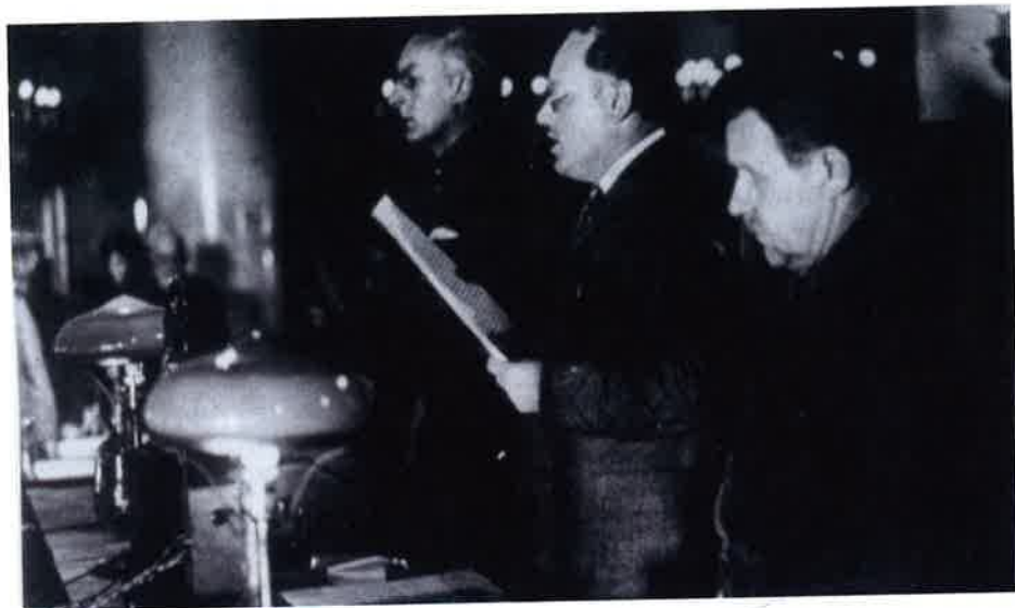
The first show trial, in August 1936

The NKVD claimed to have uncovered a Trotskyist–Zinovievist counter-revolutionary conspiracy. Zinoviev, Kamenev and 14 others were accused of organising the conspiracy and plotting to kill Stalin and other Politburo members. All 16 were found guilty and executed. Bukharin and other Right Opposition leaders were questioned but were not arrested, possibly because of disagreements within the Politburo.