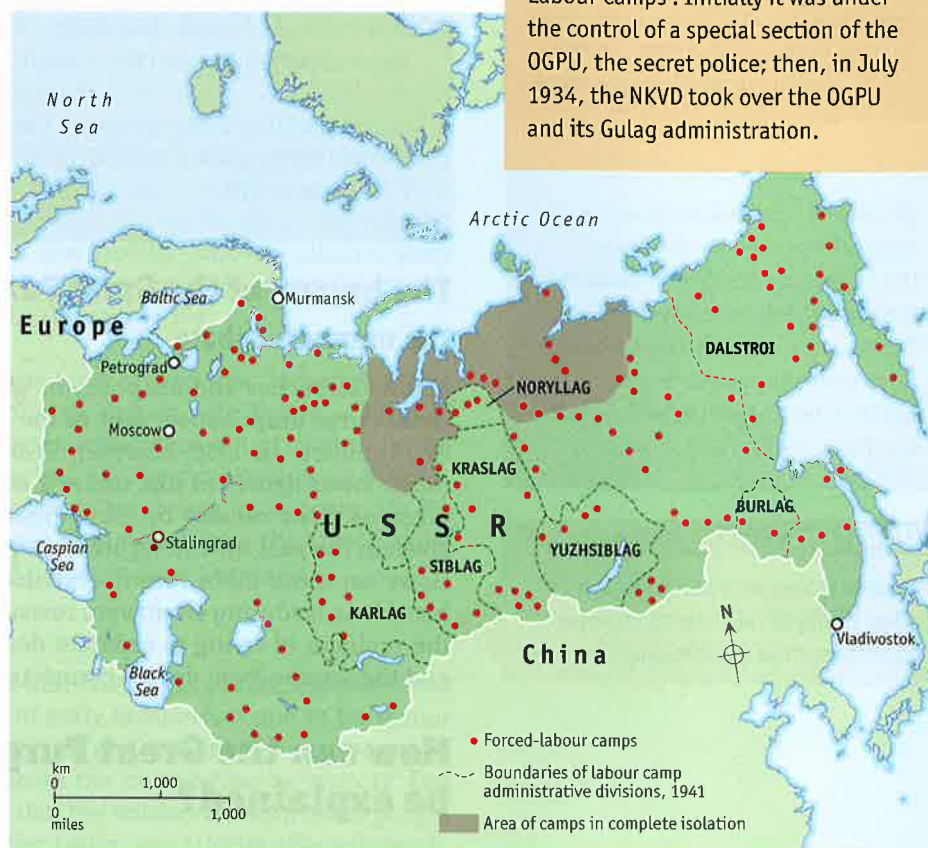
Soviet Union labour camps under Stalin

Gulag This term refers to a Soviet government agency set up in 1930 to administer the system of forced-labour camps (see page 49). Gulag is an acronym for the Russian term for the 'Chief Administration for Corrective Labour Camps'. Initially it was under the control of a special section of the OGPU, the secret police; then, in July 1934, the NKVD took over the OGPU and its Gulag administration.