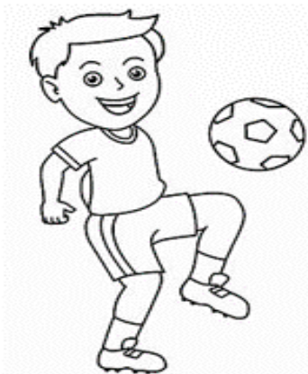
to play football