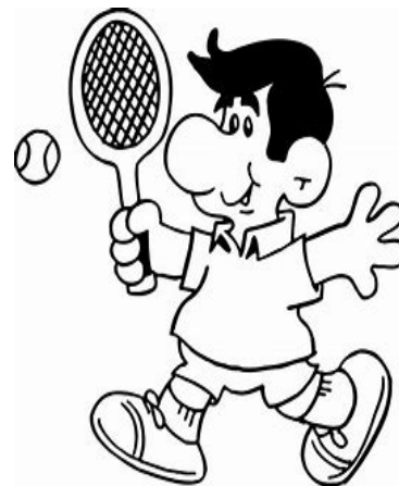
to play tennis