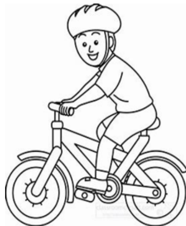
to ride a bike