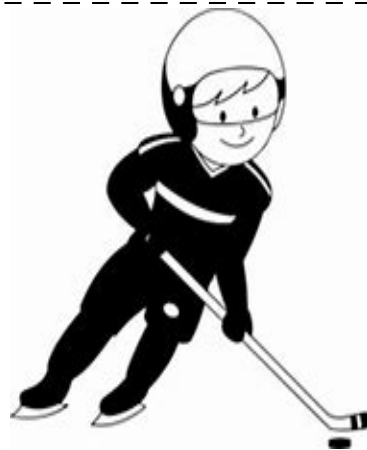
to play ice- hockey