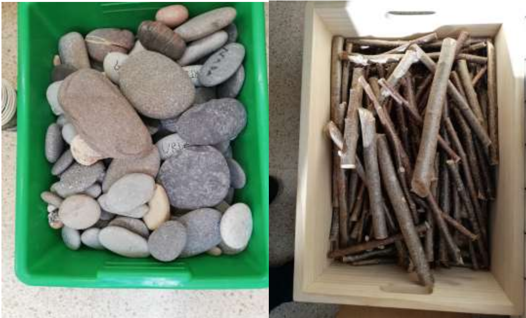
(STONES AND STICKS)

BELGIUM, FINLAND, GREECE, ITALY, SPAIN AND TURKEY