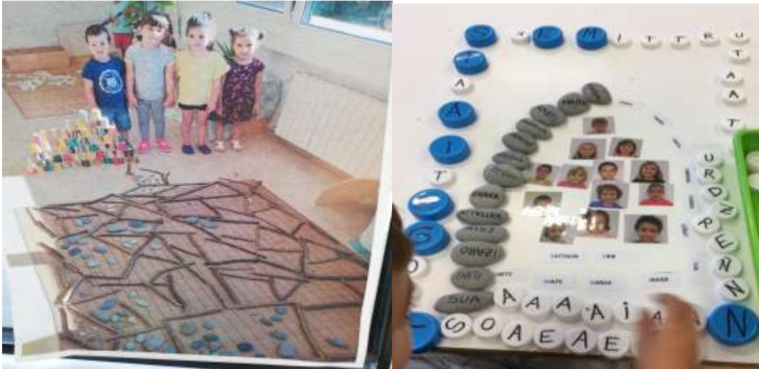
(Students construct buildings and trails. They used the materials to start reading and writing)

BELGIUM, FINLAND,GREECE,ITALY,SPAIN AND TURKEY