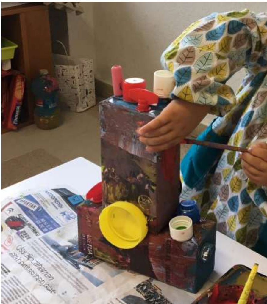
BELGIUM, FINLAND,GREECE,ITALY,SPAIN AND TURKEY