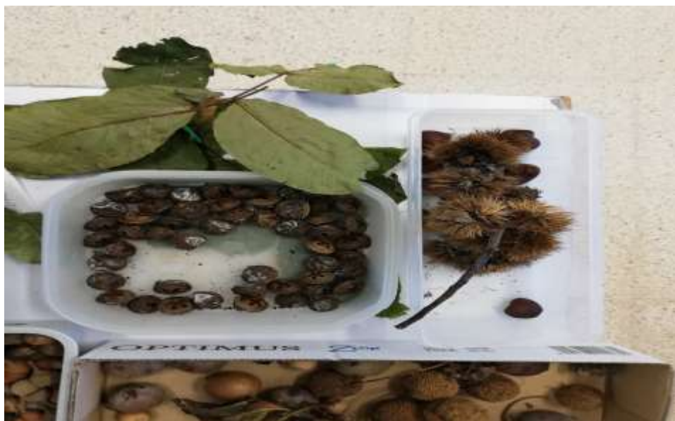
BELGIUM, FINLAND,GREECE,ITALY,SPAIN AND TURKEY