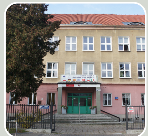
Host School Szkoła Podstawowa nr 157 in Warsaw im. Adama Mickiewicza

The second day was organised at the zoo, where through practical workshops students could explore and learn about the lives of different animal species, danger and survival. These lessons established students' understanding of the animal as an integral part of nature and its importance, as well as the possibility of seeing different animals from different regions of the world, increased students' vision and interest in general.