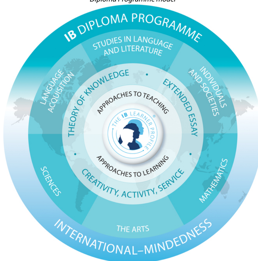
Figure 1 Diploma Programme model

The programme is presented as six academic areas enclosing a central core (see figure 1). In each of the academic areas, students have flexibility in making their choices, which means they can choose subjects that particularly interest them and that they may wish to study further at university.