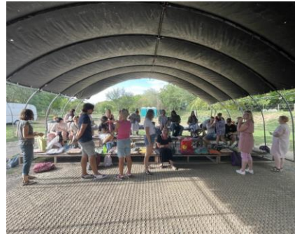
Workshop at hidepark