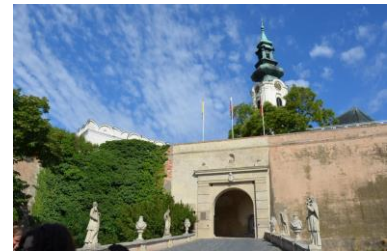
Castle in higher Nitra

It was nice to visit Gymnazium Golianova in Nitra and notice how much students' art was placed in the hallways. It makes the atmosphere very comforting. The boards of the graduated students were interesting and creative. It's something we could do in Finland as well. One thing that surprised us were the animals at the school. Those birds and fish really made our mind. It is very fun way to add comfort.