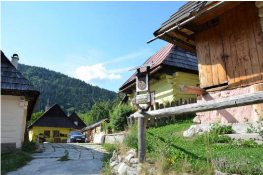
Vlkolinec village, picture by Päivi Parkkonen

After that, we left for our next destination, which was the High Tatras. We got there in the evening, so we went straight to the hotel and the next day we went hiking in the Tatra mountains. The day was varied and I got to learn a lot about Slovakian culture.