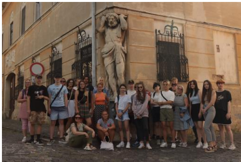
We took a group photo in front of the luck bringing statue.

After the presentation, we got to make a bag out of a t-shirt. It was an activity that was meant to expand understanding of how many things can actually be reused. There was also a drumming event in the park, to which anyone could join to. We joined for a while after some encouragement of few Slovakian students. I'm very glad that we joined. It was a fun, new and unique experience.