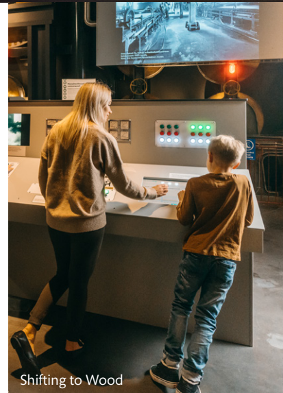
Shifting to Wood

www.merikeskusvellamo.fi/en/exhibitions/ .