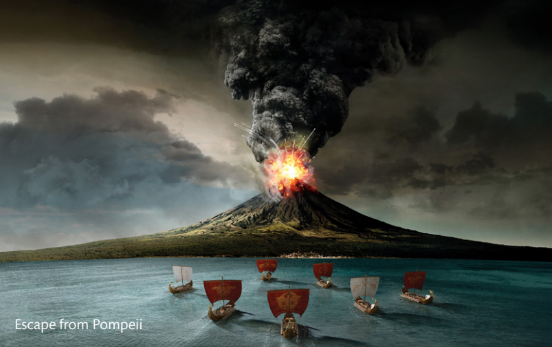
Escape from Pompeii