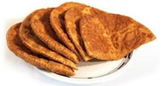
Lörtsy, a pie filled with meat or jam