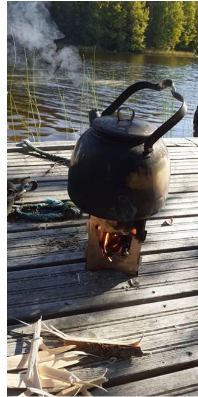
Finns sometimes make coffee even while outdoors