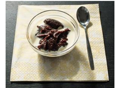
Mämmi, Finnish Easter pudding