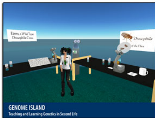
Figure 6 –Texas Wesleyan University Genome Island [11]

Besides the above institutions, BBC realized the SL potential to teach foreign languages, mainly English, having created its own space at Virtlantis 116.114.21 (PG). This institution blends SL with Internet pages, supporting the learning of several issues. Virtlantis island is formed by foreign language educators and is an example of best educational practices in SL.