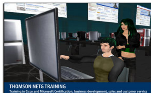
Figure 3 - Thomson Netg Training (Source: FitzGerald, & Kay) [11]

The Thomson Netg develops professional training in ICTs, management, sales and customer support. It uses SL for synchronous classes and on-demand training through audio, video or podcasts resources. Their students can interact with technological applications and do role-play activities.