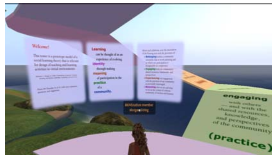
Figure 2 – NMC Educational Community (author proposal)

knowledge that is being built. It also potentiates the creation of communities of practice where people learn by sharing. These communities can be described as groups of people who share a concern or a passion for something they do and learn how to do it better as they interact regularly. (Wenger, 2000) [7]. The Iowa State University has already created the NMC Educational Community and below is their virtual representation of Wenger’s Communities of Practice. (SL Island: Teaching 4 231, 155, 25).