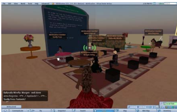
Figure 7- The workshop outcomes: tables and stools (author proposal)

At the end of the workshop, all the participants managed to create a table and a stool. As some still struggled with the pose ball for the stool, we met in-world to solve this issue.