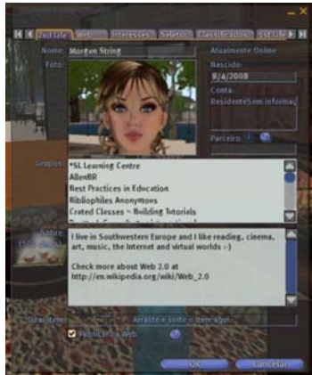
Figure 1 – Avatar’s profile: Morgen String (author proposal)

Second Life (SL) is a world that tries to reproduce the real one, including the development of rules and even its own economy. People are represented by their avatars (their 3D representations) and they communicate through chat (voice or written text), notecards, their profiles or Instant Messages (IM). The latter are delivered if the resident is not online at the moment s/he logs in.