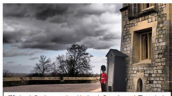
Winds or's Castle on another side, there's Queen's guard. Those clouds were dark because of unexpected rain.

Windsor Castle is covering an area that is almost 53,000 square metres. In the castle there are 1,000 rooms. The original idea for building was that it would defensive has successfully hold out sieges that lasted many months in have past. Nowadays the castle is owned by Queen Elisabeth II. Every many hundreds of thousands of tourists visit there because the castle is open for public throughout the year.