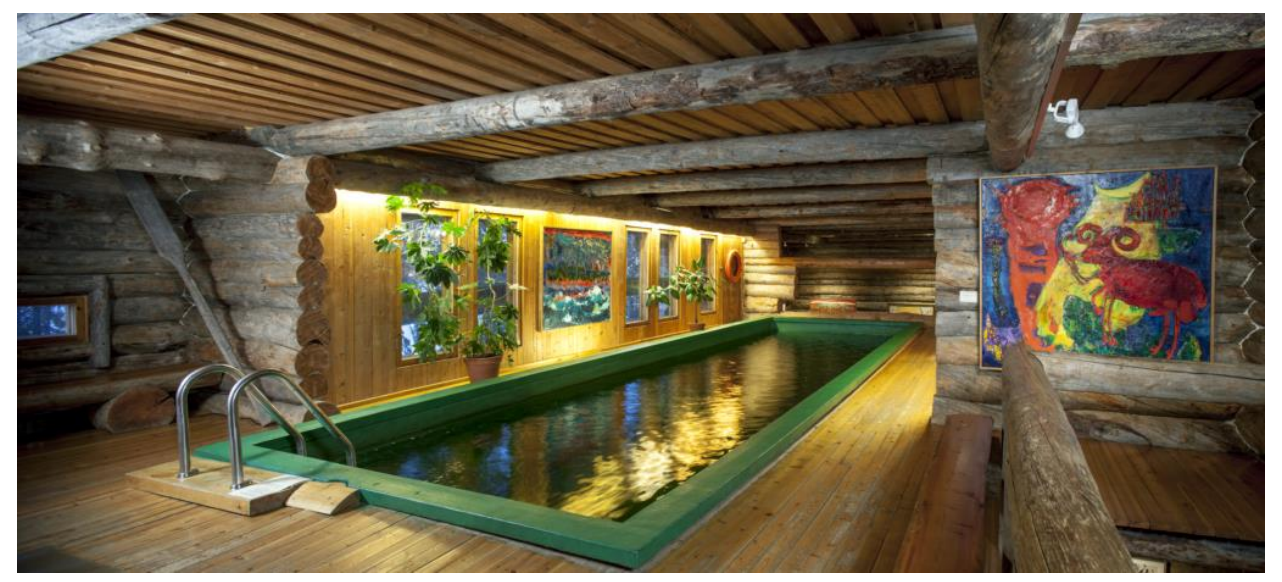
Särestöniemi-museum <a href="https://www.kaukosorjosensaatio.fi/sarestoniemi-museon-esittely/">https://www.kaukosorjosensaatio.fi/sarestoniemi-museon-esittely/</a>