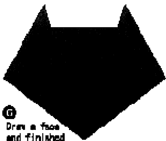
6 Draw a face and finished