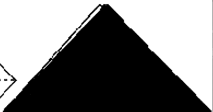
2 Fold in half to make crease