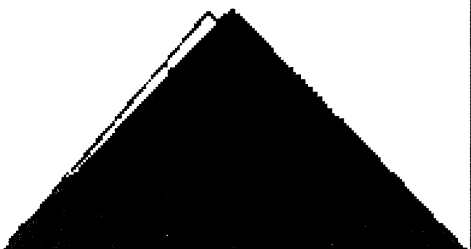
3 Fold in the dotted line