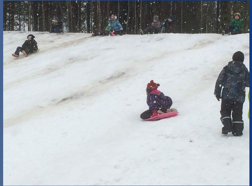
At last we got some snow!