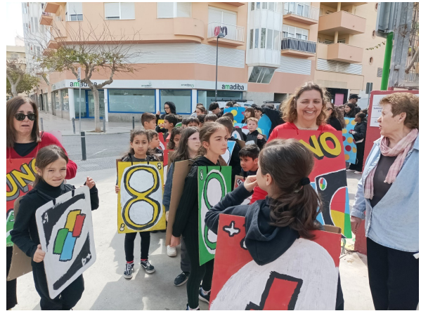
Spain evidence. Students and teachers display the completed recycled artworks during a school activity.