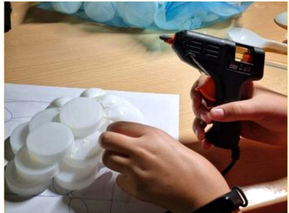
The student fixes plastic pieces step by step during the construction stage.