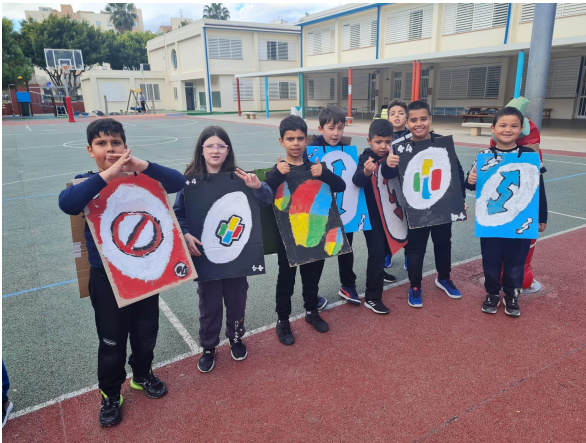
Spain evidence. Students present large recycled cardboard artworks in the school yard.

The Spain photographs document the presentation and school display of large recycled artworks. Students used cardboard and painted surfaces to create visible products connected with sustainability and shared participation.