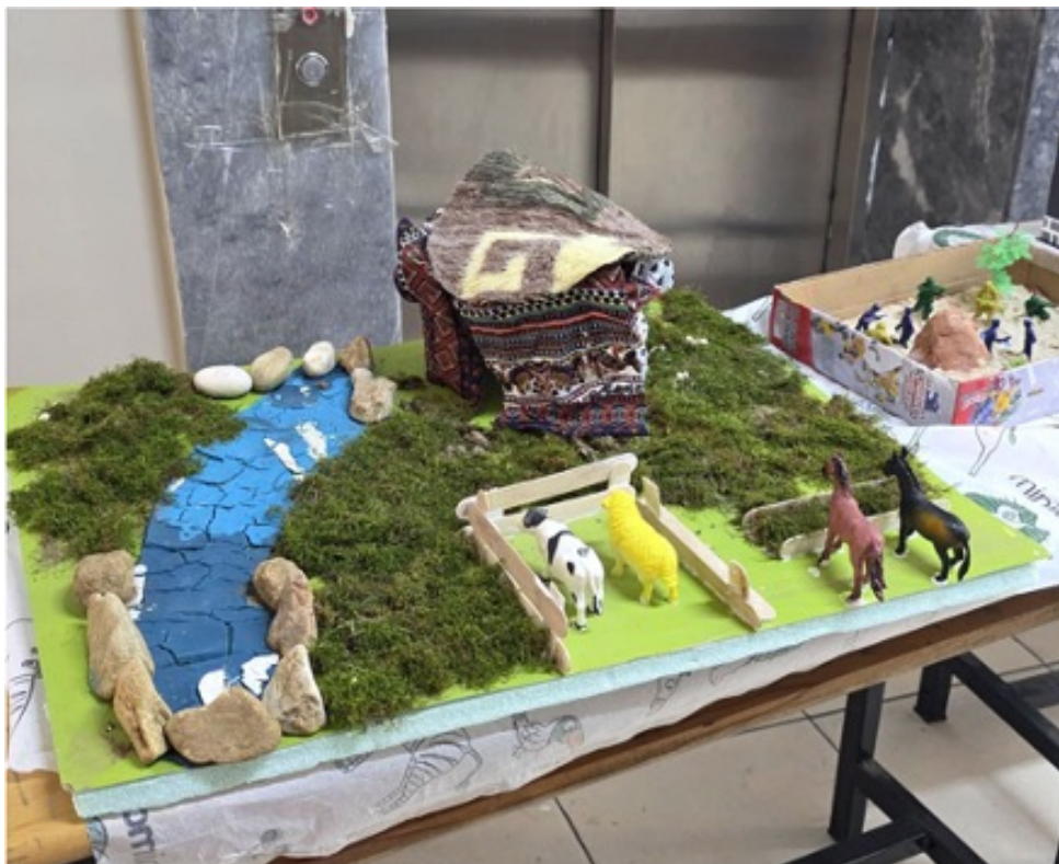
Photo 2: A completed model made with reused, recycled and natural materials is displayed.