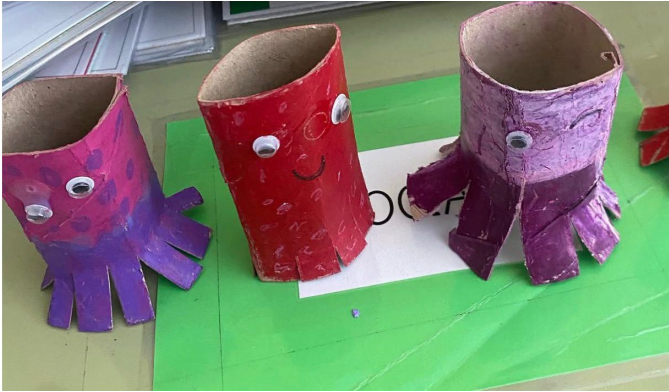
Reused cardboard rolls were turned into colorful classroom art figures

The Italy photographs show individual and group products created from reused classroom materials. Students prepared small models, paper figures, cardboard structures and displayed products as part of the activity.