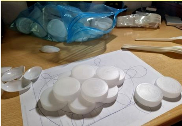
Plastic spoons and caps are prepared as reusable materials for the artwork.

The Finland photographs show the preparation and construction process. Students used plastic spoons and caps as reusable materials and transformed them through cutting, arranging and fixing with silicone.