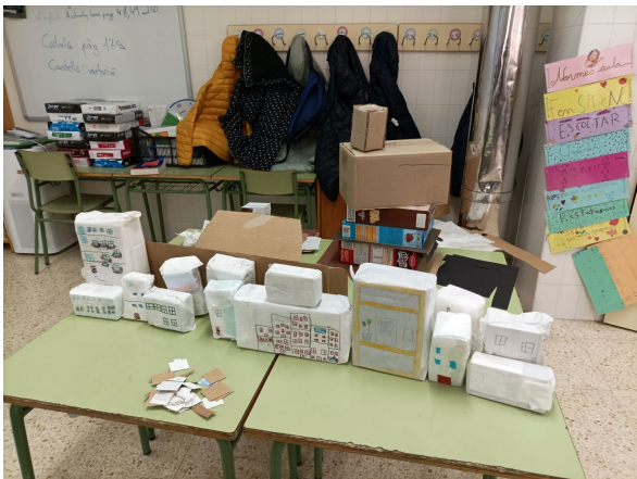
Italy. Recycled cardboard and paper models are arranged for display.

Product description: The evidence shows that students worked with different materials and product types. The activity supported creativity, manual production and the transformation of everyday materials into meaningful classroom outputs.