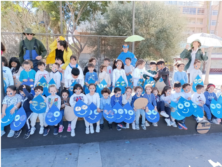
Spain evidence. Students hold blue recycled artworks during the group presentation.

Product description: The products were presented in a shared school environment, showing that recycled material artworks can become part of a wider awareness activity for students, teachers and the school community.