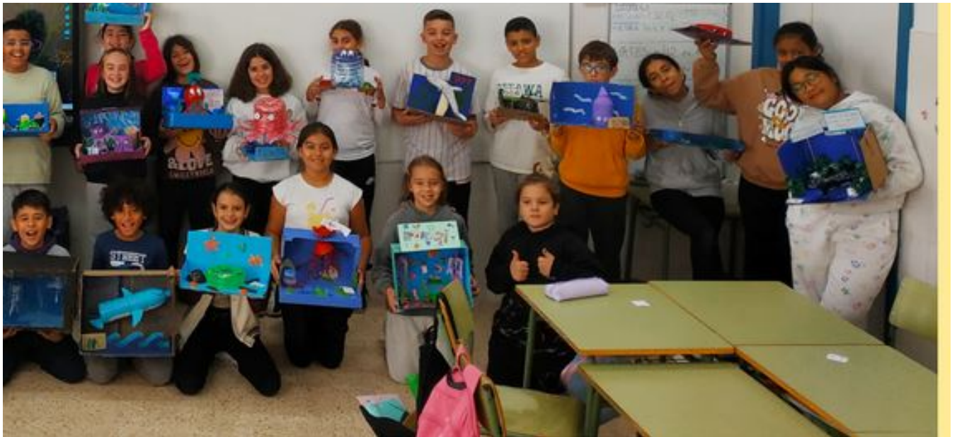
Finnish students show their recycled material artworks.

Product description: The work demonstrates how simple plastic materials can be reused for a classroom artwork. The step by step process makes environmental responsibility visible and connects it with care, patience and collaborative production.