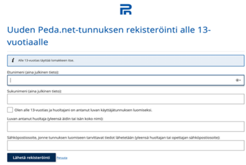
Figure 1. Ordering the registration for a child under the age of 13 to the guardian's e-mail.

Child under the age of 13 can retrieve the service for him/herself only by the consent of the guardian. OmaTila is obtained for the pupil from the Internet address https://peda.net/:register by entering the attached address in the Internet address field of the web browser and following the login instructions of the service (Figure 1). It may take a moment for the e-mail confirmation to arrive to the guardian. The confirmation allows you to determine the pupil's username (Figure 2). The username is chosen for the pupil, for example, according to the pupil's first and last name. If the service already has a pupil with the same name, you can add, for example, the first letter of the middle name between the first and last names.