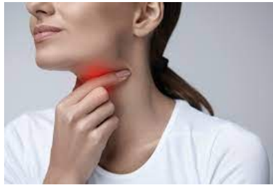
a sore throat