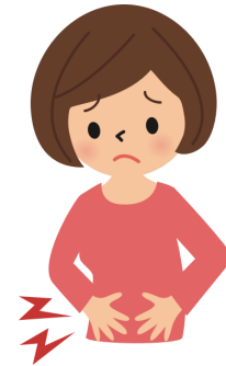
a stomach ache