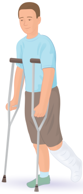
a broken leg