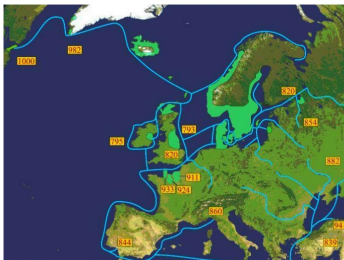
Years and routes for some important Viking trips.

Trading accelerated, great treasure finds like the one from Vårby shows that. The treasure contained jewelry and costumes from both Russia and the Muslim Empire, the Caliphate.