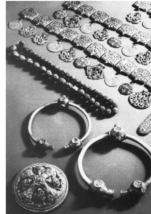
Treasures found in Vårby, Huddinge, Södermanland

The Viking ships were sleek, fast and safe. The construction enabled them to withstand long sea voyages while being suitable as landing vessels because of they could sail on very shallow waters.