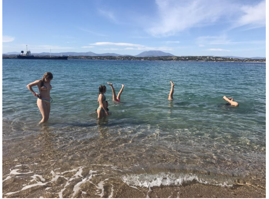
We even had time to enjoy the beach!