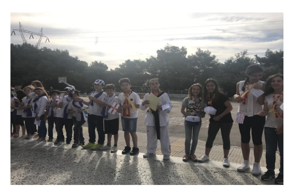
Our new friends at schoool welcome us with a warm party! We enjoyed a lot